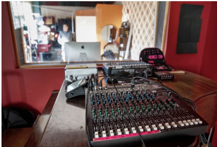
A mixing board sits on top of a piano in one of the studios at the Brighton Sound Museum.

After nearly a year in limbo, the Sound Museum, a large music rehearsal complex in Brighton, will close at the end of January.